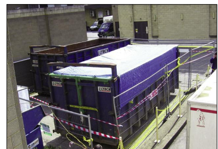
It is not good enough to throw sheeting over a standard skip

This guidance is issued by the Health and Safety Executive. Following the guidance is not compulsory and you are free to take other action. But if you do follow the guidance you will normally be doing enough to comply with the law. Health and safety inspectors seek to secure compliance with the law and may refer to this guidance as illustrating good practice.