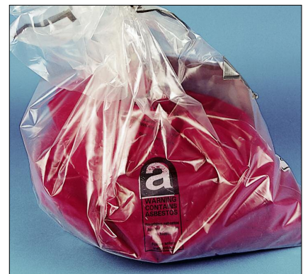
All waste should be double-bagged or double-wrapped in plastic sheeting, with the correct hazard warning signs attached.