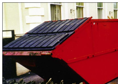
Use a lockable skip for asbestos cement sheet