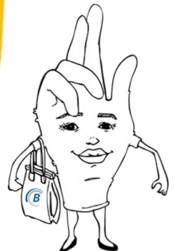
Ms. G. Love™ represents BioClean's range of cleanroom gloves